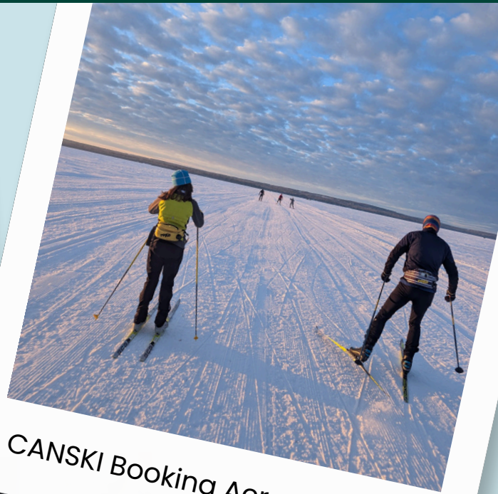
CANSKI Booking Across the Bay