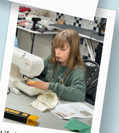
Lifelong sewing skills