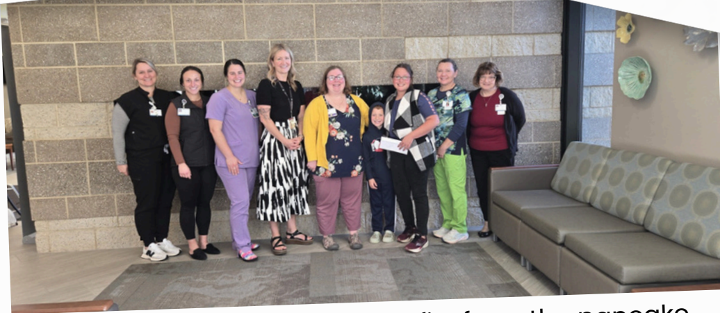
Team 4-H donating $700 profits from the pancake breakfast to the Cancer Center