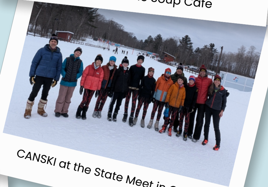
CANSKI at the State Meet in Cable!