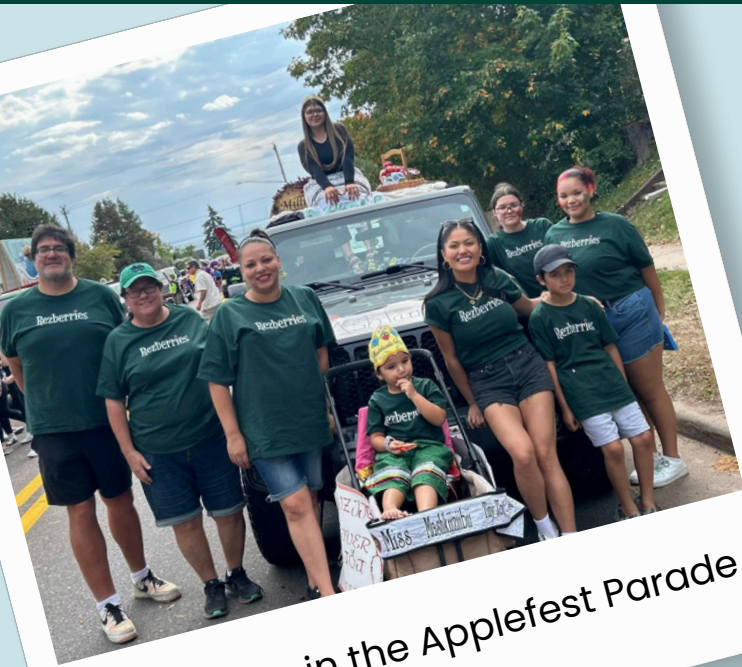
Rezberries in the Applefest Parade