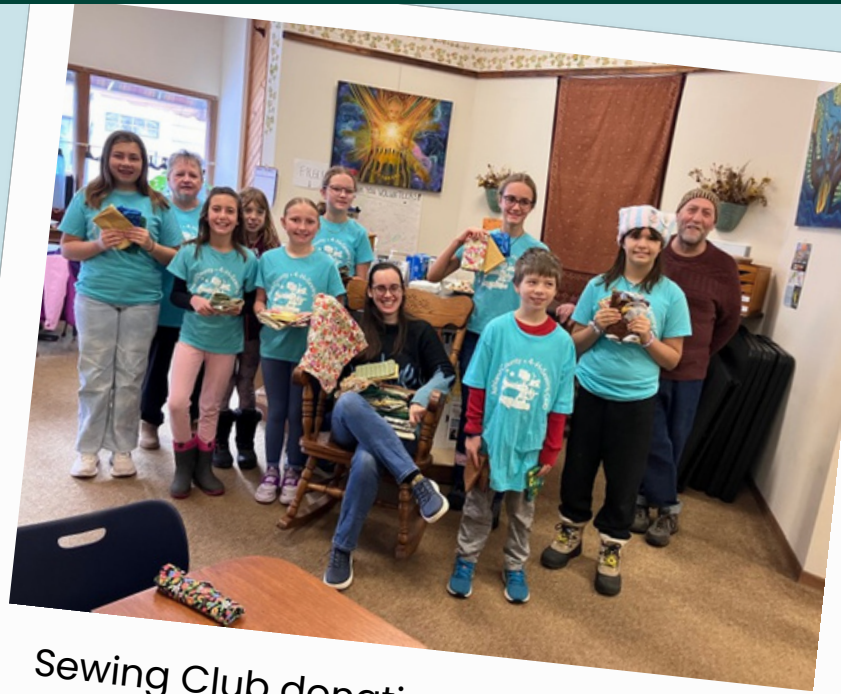
Sewing Club donating their hand-sewn napkins to Stone Soup Cafe