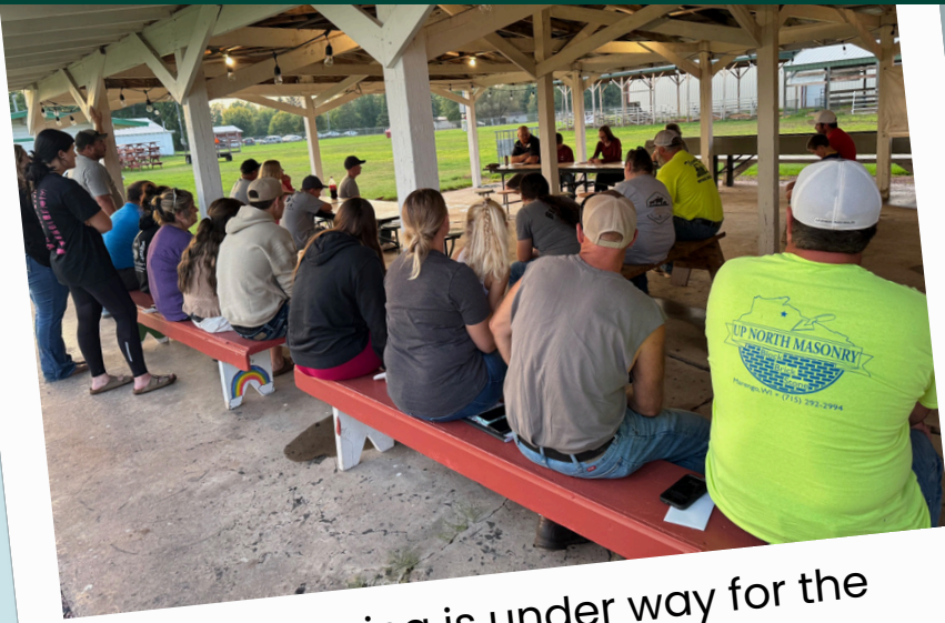
Fair planning is under way for the Market Sale Club!