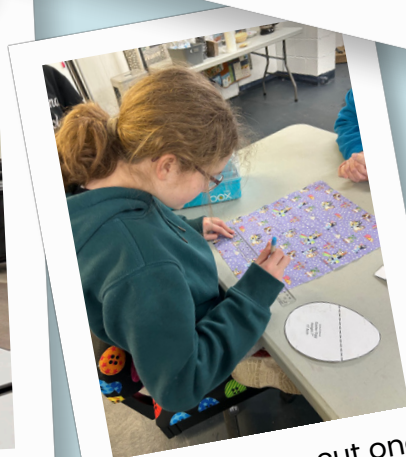
Measure twice, cut once