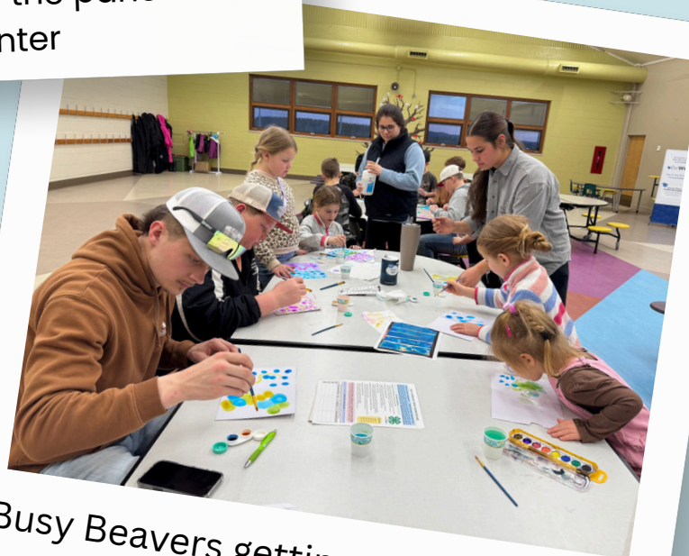
Busy Beavers getting creative for the Spring Art Contest