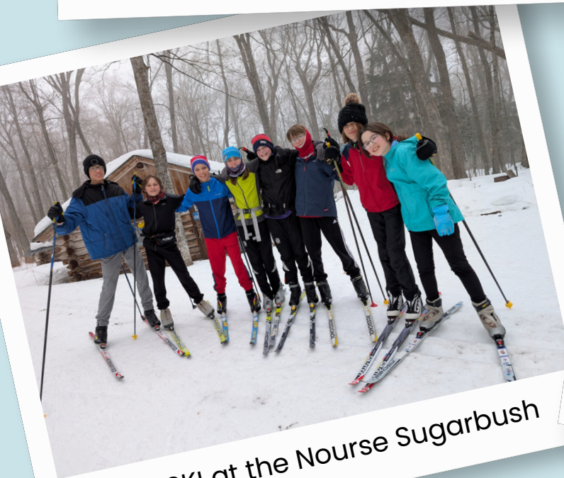
CANSKI at the Nourse Sugarbush